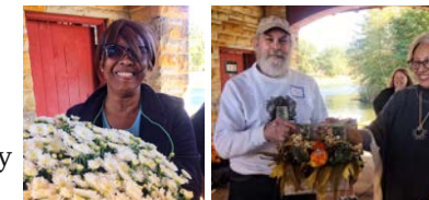
Many raffle winners received mums and pumpkins.