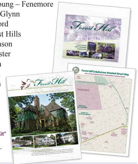
Parts from the new “Forest Hill Welcome Kit” that each homeowner receives after move-in.