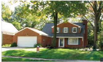
This Rumson Road home recently completed major renovations and is now back on the market.

Another chronic problem home on Newbury near Brewster was transferred from two years of bank owned never-never-land and is now owned by HUD. At the other end of Newbury near Mayfield a home that has been vacant for years has finally wound its way through the courts and is now owned by the state of Ohio. We expect to see these homes back on the market soon.