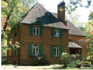
This long-term chronic problem house on Henley Road has FINALLY been sold and will transfer soon to new owners.

When FHHO Standards started tracking vacant homes, we found that it was next to impossible to contact the banks that own some of the properties, let alone get someone to maintain the property. Now seven years later things look like they are finally starting to loosen up.