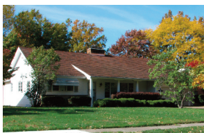
This Carver Road home slate roof was repaired rather than being replaced.

The above properties are the more dramatic cases, but we have had some success with residents who have moved forward with performing home repairs after being put on notice. We don't take all the credit. We have worked closely with the Cleveland Heights Housing Department on problems where they have been able to apply additional pressure. We are also trying to foster a stronger working relationship with East Cleveland to do the same.